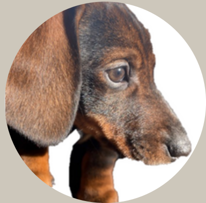
Dash Chief Biscuit Muncher

FILL IN THE CONTACT PAGE ON OUR WEBSITE TO START THE PROCESS WWW.NATALIEROUKININTERIORS.COM