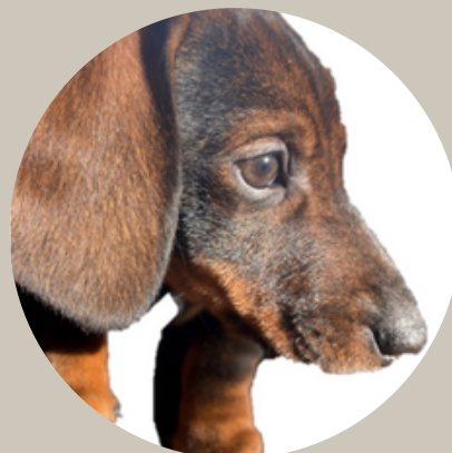
Dash Chief Biscuit Muncher

INTERESTED TO KNOW ABOUT OTHER SERVICES WE PROVIDE? VISIT: WWW.NATALIEROUKININTERIORS.COM/SERVICES