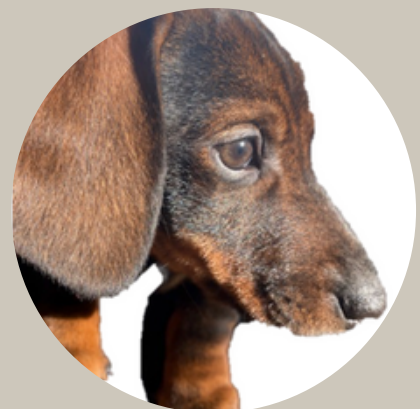
Dash Chief Biscuit Muncher

INTERESTED TO KNOW ABOUT OTHER SERVICES WE PROVIDE? VISIT: WWW.NATALIEROUKININTERIORS.COM/SERVICES