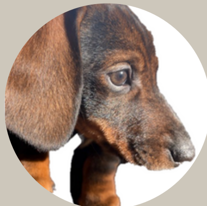
Dash Chief Biscuit Muncher

INTERESTED TO KNOW ABOUT OTHER SERVICES WE PROVIDE? VISIT: WWW.NATALIEROUKININTERIORS.COM/SERVICES